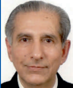
DR. Y K AMDEAKR SIR